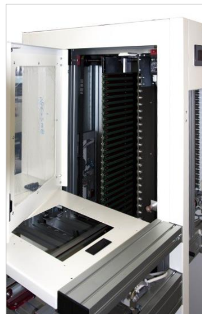
SA-FC-BUF-FFB with integrated LC1S

Imagery for illustration purposes only. Please consult your local Seica Automation distributor for more information.